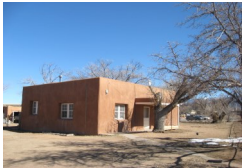
Below: All the windows of the caretaker's residence, which also is historically protected, were repaired and restored at significant expense to the FCPA. The residence is now used as a rental to help defray maintenance costs.