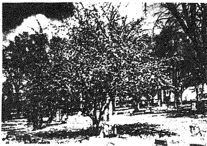
PINK CRABAPPLE TREE ON THE THORNTON LOT AT THE HEIGHT OF ITS GLORIOUS BLOOM IN APRIL.